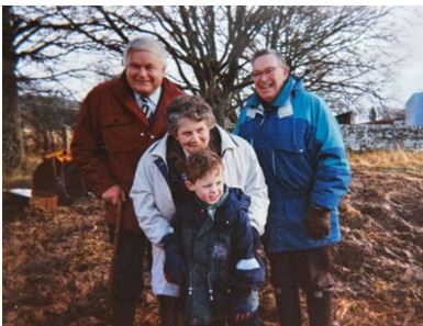
"Cutting the first turf" ceremony.