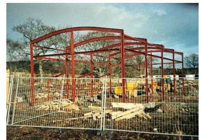
Press photo mid construction.

Ardross Community Hall was built as a Millennium Project with grants applied for and funds raised by the community of Ardross. It was constructed on land kindly donated to the community. The Hall was officially opened on 2 nd September 2000.